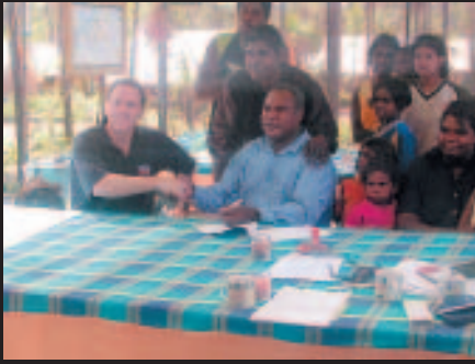
Left: Signing ceremony for the new KWA Ungolan Wilderness Camp lease.