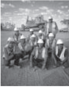
KGT trainees at Argyle Diamond Mine.