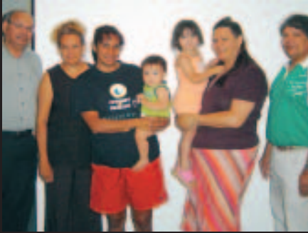
Above: Olympic and Commonwealth Games Gold Medalist Nova Peris visits Wunan House.