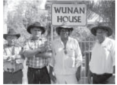
ATSIC Regional Councillors visit Wunan House.

KGT is managing 134 Indigenous Trainees and Apprentices across a number of industries and skill areas. These outcomes being achieved are a credit to KGT's Committee and staff, and to the aspiring young Aboriginal people who have taken responsibility for their futures.